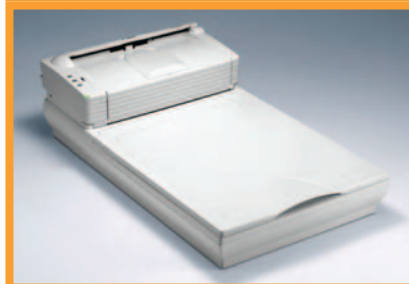
DR-2580C with optional Flatbed Scanner

Compact, powerful, and fast. The DR-2580C is a versatile scanner designed to meet the diverse imaging needs of your busy office. This innovative machine offers you the most advanced features in document scanning. Better yet, it comes bundled with the latest version of CapturePerfect and Adobe Acrobat, so it's easy to use right out of the box. Most important, it's from Canon, the brand the world relies on for the latest solutions in imaging technology.